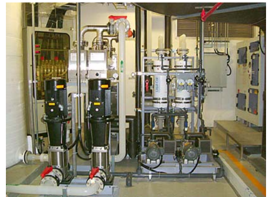
Second Stage Liqui-Cel Polishing System for CO 2 and O 2 Removal

This product is to be used only by persons familiar with its use. It must be maintained within the stated limitations. All sales are subject to Seller's terms and conditions. Purchaser assumes all responsibility for the suitability and fitness for use as well as for the protection of the environment and for health and safety involving this product. Seller reserves the right to modify this document without prior notice. Check with your representative to verify the latest update. To the best of our knowledge, the information contained herein is accurate. However, neither Seller nor any of its affiliates assumes any liability whatsoever for the accuracy or completeness of the information contained herein. Determination of the suitability of any material and infringement of any third party rights, including patent, trademark, or copyright rights, are the sole responsibility of the user. Users of any substance should satisfy themselves by independent investigation that the material can be used safely. We may have described certain hazards, but we cannot guarantee that these are the only hazards that exist. Nothing herein shall be construed as a recommendation or license to use any information that conflicts with any patent, trademark or copyright of Seller or others. Please read our Operating Manuals carefully before installing and using these modules.