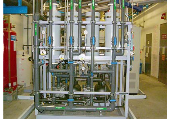
First Stage Liqui-Cel System for CO 2 and O 2 Removal

For more information on using Liqui-Cel Membrane Contactors in your application, please visit us on-line at www.liqui-cel.com or call us at the numbers listed below.