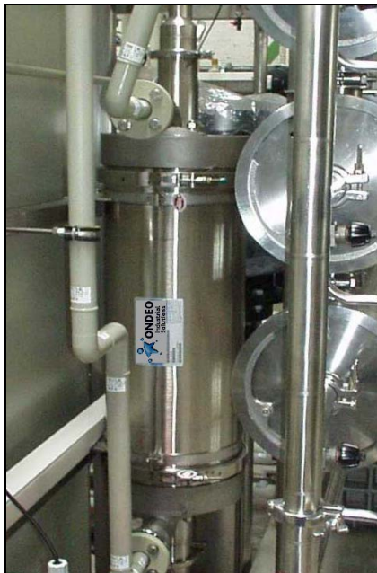
Contactors in an 8m 3 /h ROCEDIS plant

In treating water for the production of pharmaceuticals, the concentration of gases dissolved in the water plays an important role. In many cases the CO 2 content in the raw water has to be further reduced to obtain purified water with a conductivity of < 1.3 μS/cm (at a temperature of 25°C).